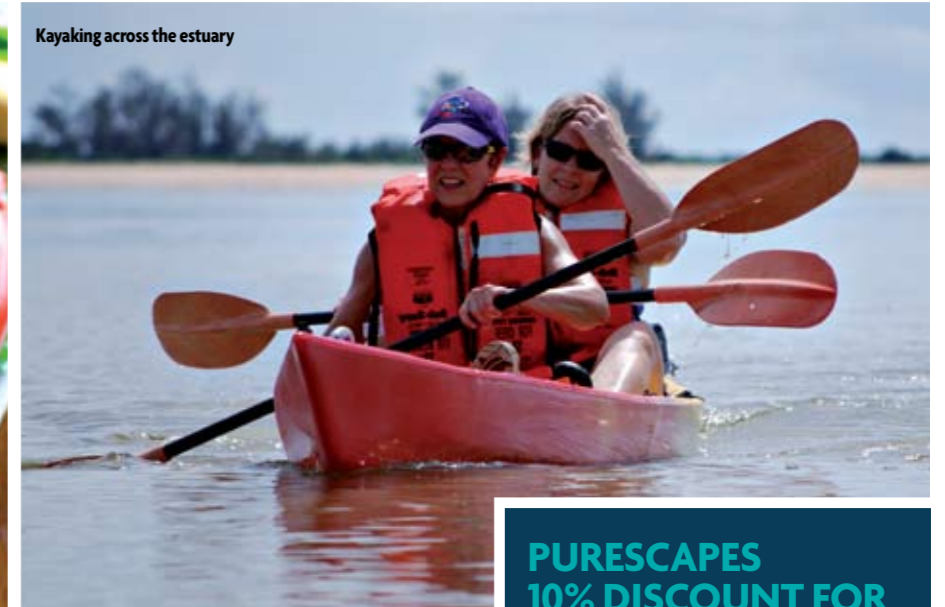
Kayaking across the estuary

When it came time for goodbyes, there's a traditional morning workout called the W.I.L.Y workout (Wish.I'd.Left.Yesterday). Ben had designed a gruelling workout plan with Turkish get-ups, deep lunges, star