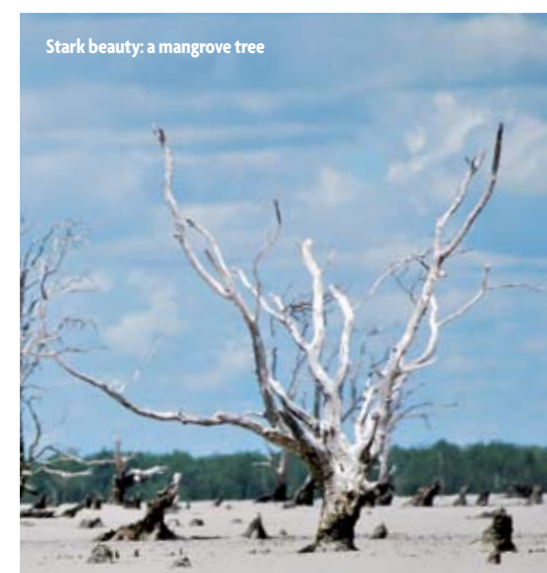
Stark beauty: a mangrove tree