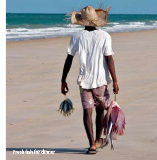
Fresh fish for dinner

When the activities for the day listed a game of volleyball, my stomach turned. I was, well, pathetic, but once I stopped worrying about what the others thought, I gained momentum and eventually had the team high-fiving my performance. I had real, laugh-out-loud fun – that's serotonin for you, I guess. And against the beautiful