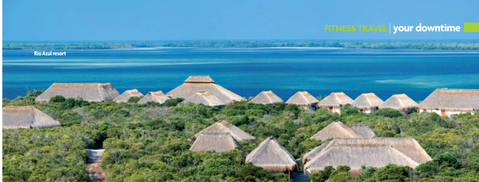
Rio Azul resort

“As soon as the kayak floated to the shore, I dropped myself over the edge and just lay in the water. What an incredibly invigorating workout!”