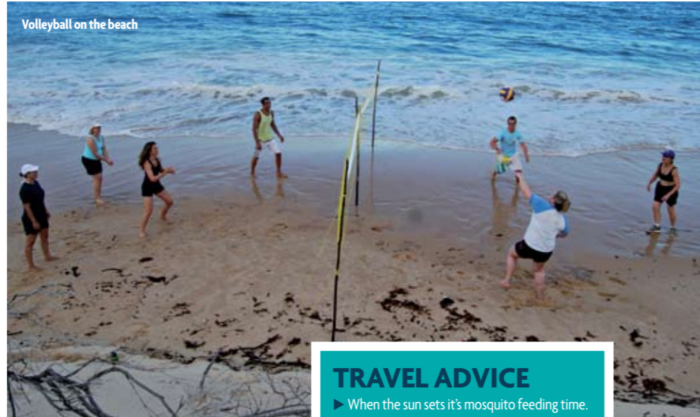
Volleyball on the beach

Kayaking across the estuary, I thought it would be best to accompany one of the personal trainers. “If you want to turn left, paddle more on the right.” This is usually