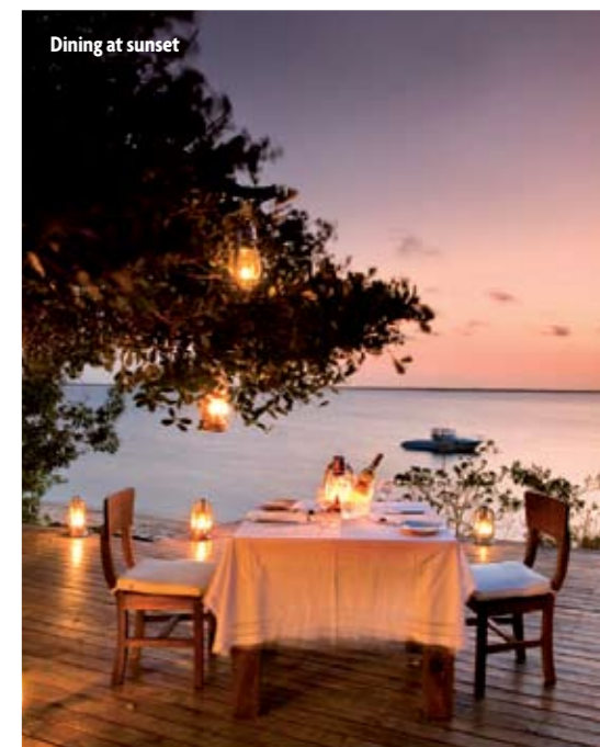
Dining at sunset